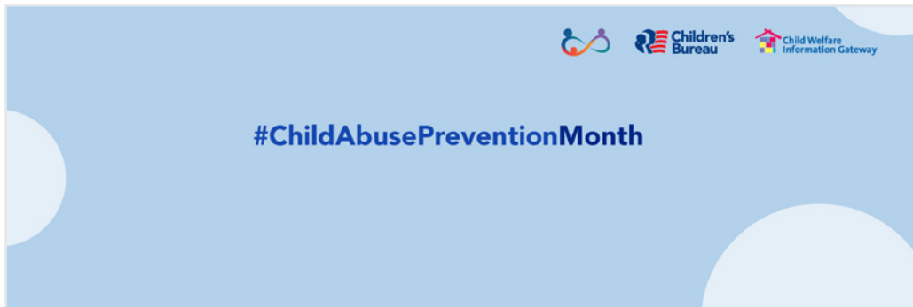
Facebook Cover Photo | X (formerly Twitter) Cover Photo